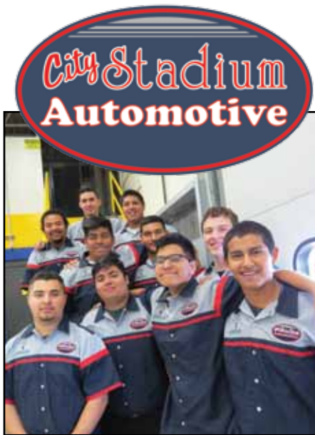
Green Bay Area Public Schools

The automotive industry in the United States and Wisconsin is forecasted to remain a growing industry. Recognizing the need for a skilled automotive workforce, the Green Bay Area Public School District expanded the automotive technician lab at Green Bay East High School in 2015 to form City Stadium Automotive®. On November 4, 2016, City Stadium Automotive® celebrated its first anniversary.